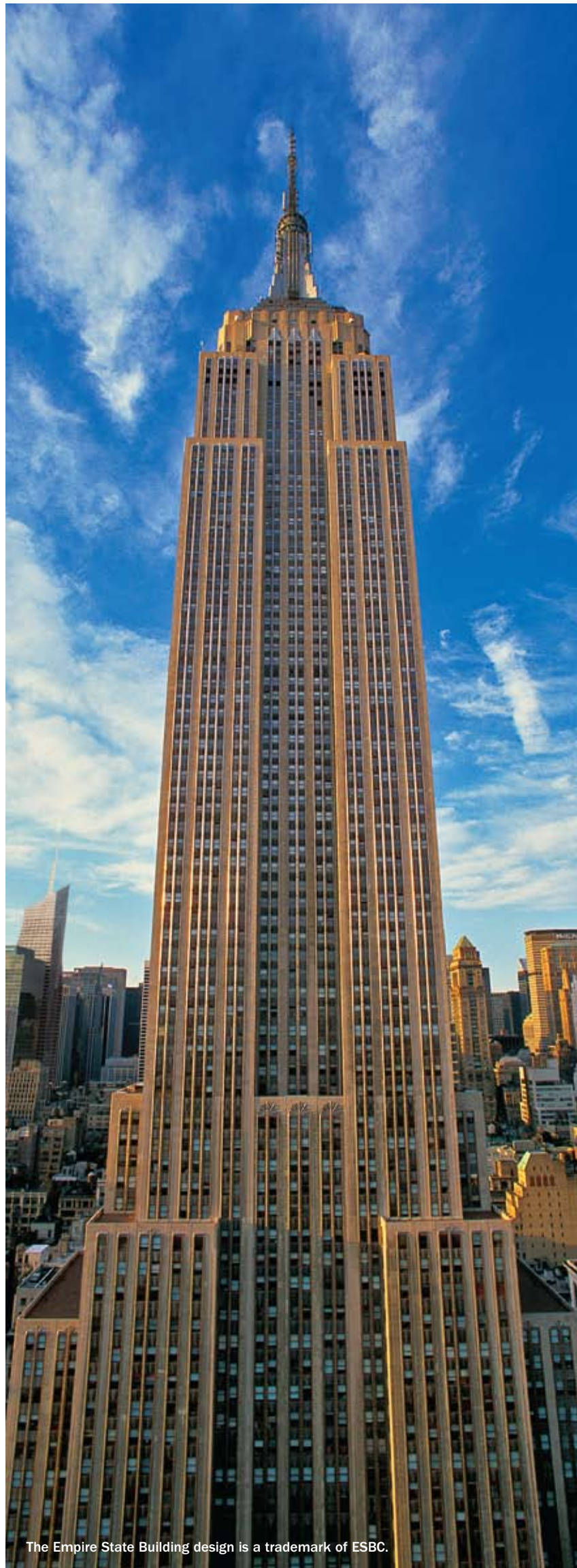
The Empire State Building design is a trademark of ESBC.